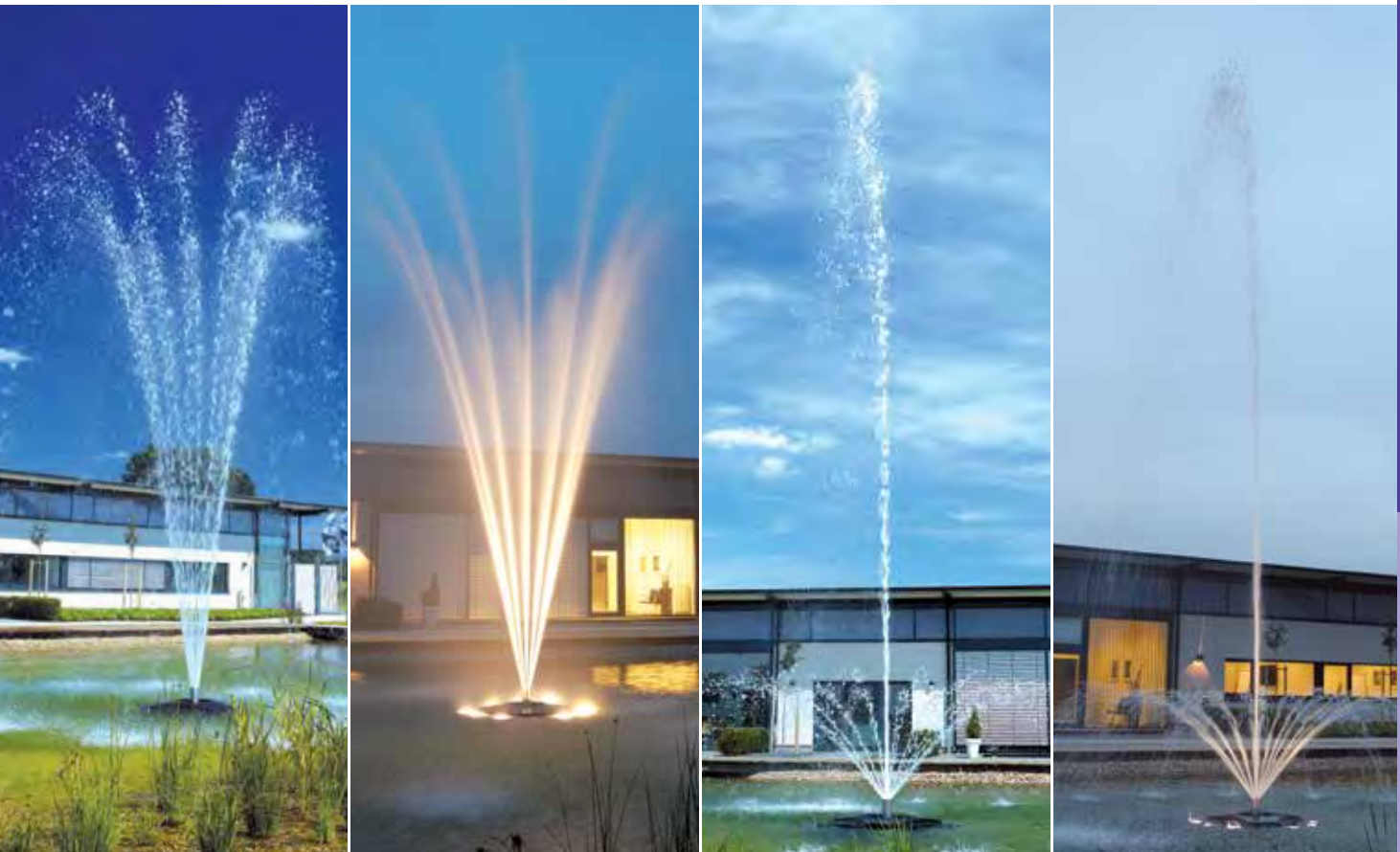
Grand Vulcan 30